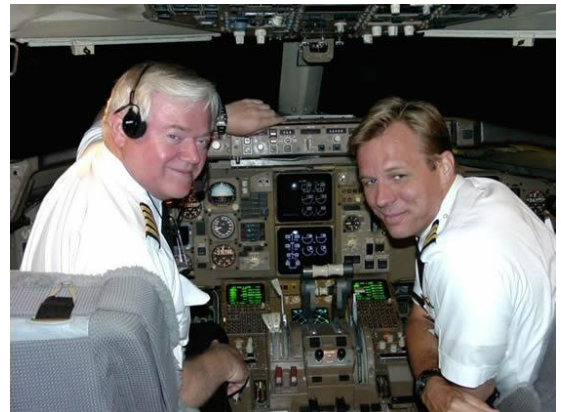
Delta Airlines pilots in a cockpit

There are many things that a pilot must do before he or she flies a plane. They must check out weather conditions on the flight path and around the landing area. They also have to check flight plans, fill in forms and do a lot of paperwork . Before takeoff pilots brief their crew and do a complete check of the airplane to see if everything works the way it should. Pilots must calculate how much fuel they have to take with them.